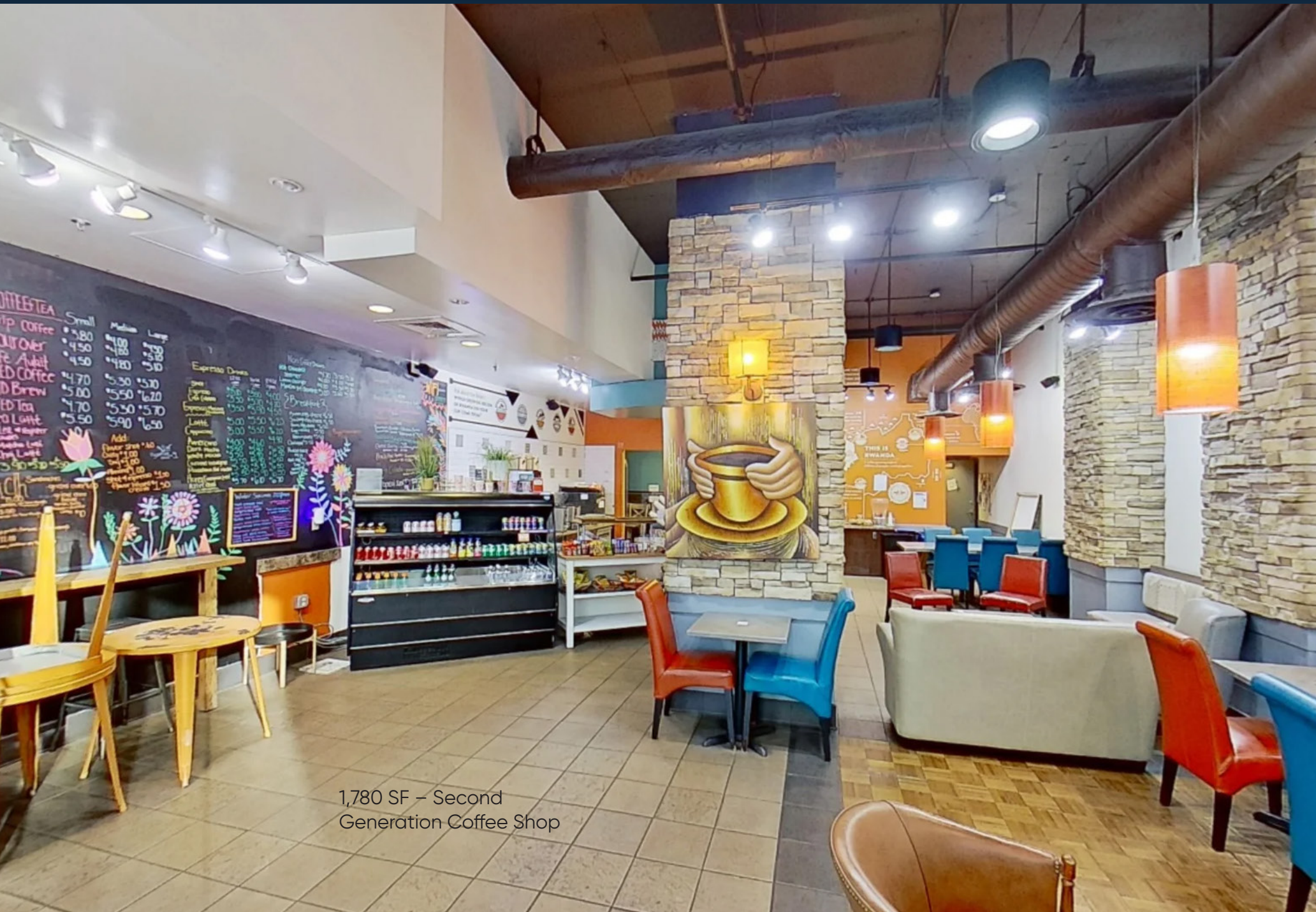
1,780 SF – Second Generation Coffee Shop